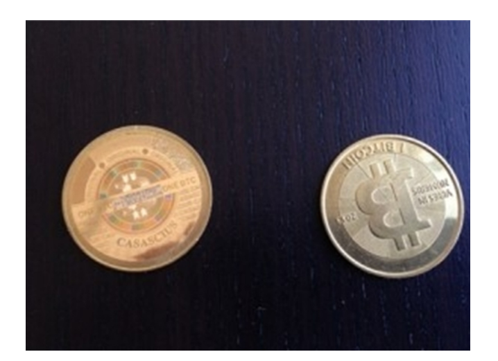
Fig. 1. Bitcoin.

M.C. Van Hout, T. Bingham / International Journal of Drug Policy xxx (2013) xxx-xxx